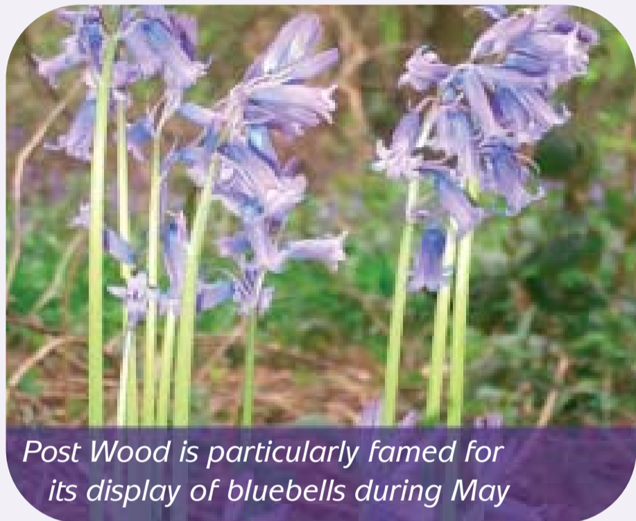
Post Wood is particularly famed for its display of bluebells during May

While you are out, you are also doing your health a favour. Regular moderate activity such as brisk walking is enough to keep you in shape. You don't need to sweat or pant - feeling warm and breathing harder than usual will give you benefits. You're never too old or too far gone to start. There are other leafleted walks in the local area, for instance through Hartham Common and Kings Mead. Please contact The Countryside Management Service to obtain these.